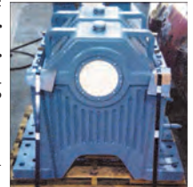
FE bearing pedestal face showing machined fins

The first Flanders universal pedestals with the new style cooling fins were installed with no flaws. However, field data of the percentage of temperature change is currently being recorded and evaluated for actual temperature change in the field. Field data results will be published in the next newsletter issue (July/Aug/Sept 2011).