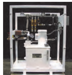
Oil Cooler Unit: front view, pump, reservoir, site tubes and pressure gauges