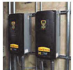
Variable Speed Drive=Efficiency