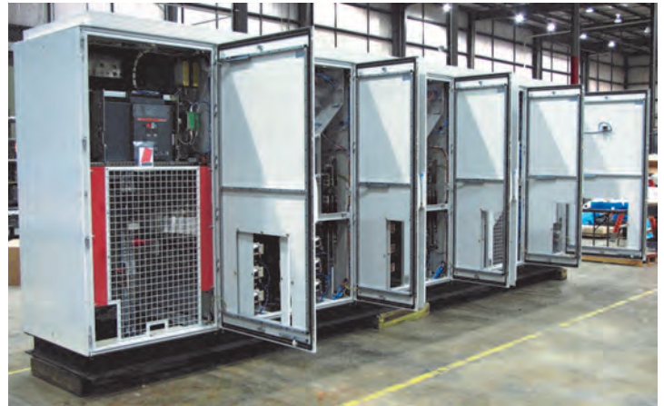
Completely customized to suit