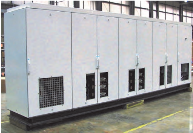
Cabinets joined together atop Flanders' Unitary Base

Contact Flanders with your next green or renewable energy project and see how we can be your supplier of choice!