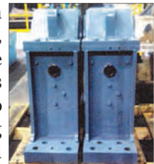
FE bearing pedestal side showing oil sight glass/window