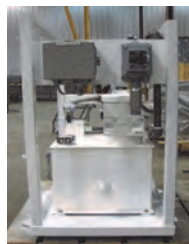
Oil Cooler Unit: side view, pump, reservoir and control equipment

Flanders designed and built four small oil recirculation systems that utilized a water to oil heat exchanger, oil flow/balancing manifold and lubricating oil to each motor bearing pedestal. Individual flow switches provide low flow indication for each bearing. The system was built as a compact free standing system requiring a single 120VAC feed for the circulation pump.