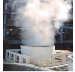
Precise Airflow Control