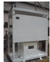
Oil Cooler Unit: front view, with front cover panel